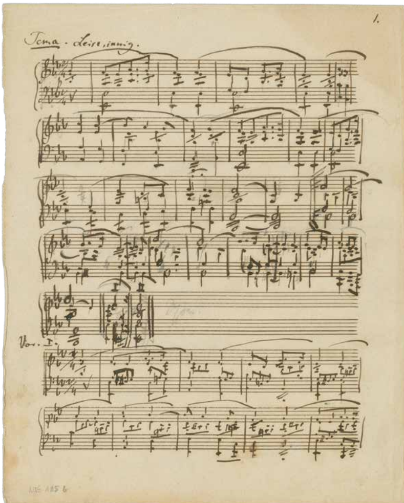
The theme of the Geistervariationen , Schumann’s last completed work, in the composer’s own hand