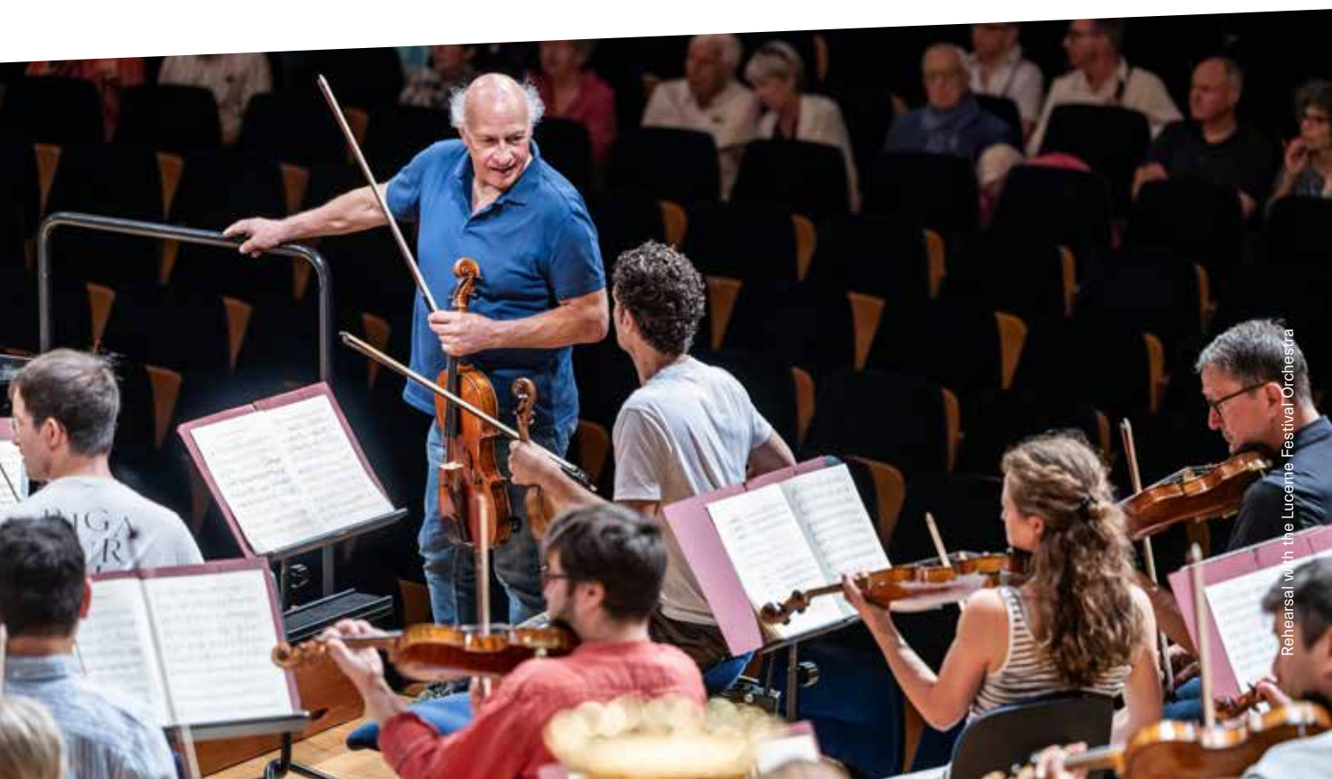
Rehearsal with the Lucerne Festival Orchestra

As a Friend or Young Friend of Lucerne Festival, you can enhance your concert experience through visits to rehearsals, encounters with the performers, and special introductory offers. You have exclusive access to the Friends Lounge during the Summer Festival, belong to a network of music enthusiasts, and regularly go on cultural and musical trips together.